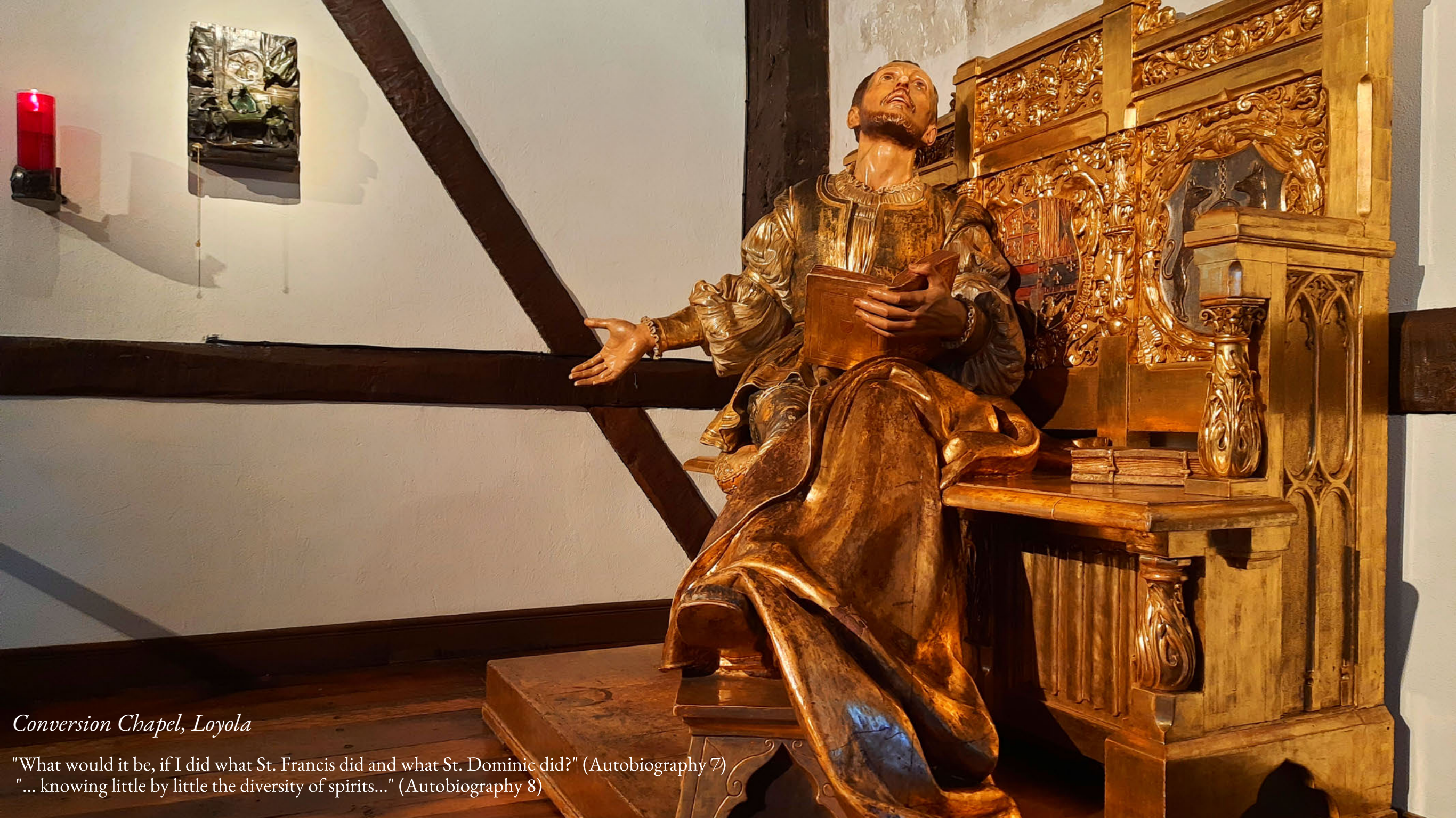
Conversion Chapel, Loyola

"What would it be, if I did what St. Francis did and what St. Dominic did?" (Autobiography 7)