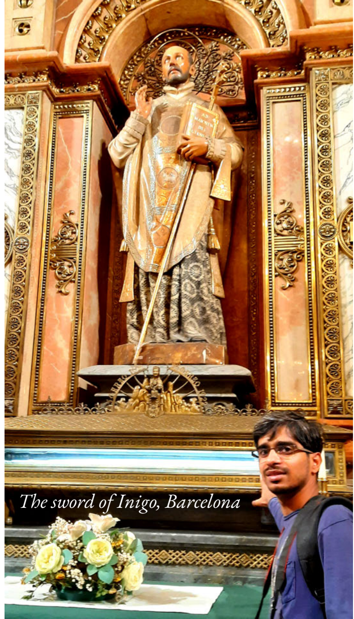
The sword of Inigo, Barcelona