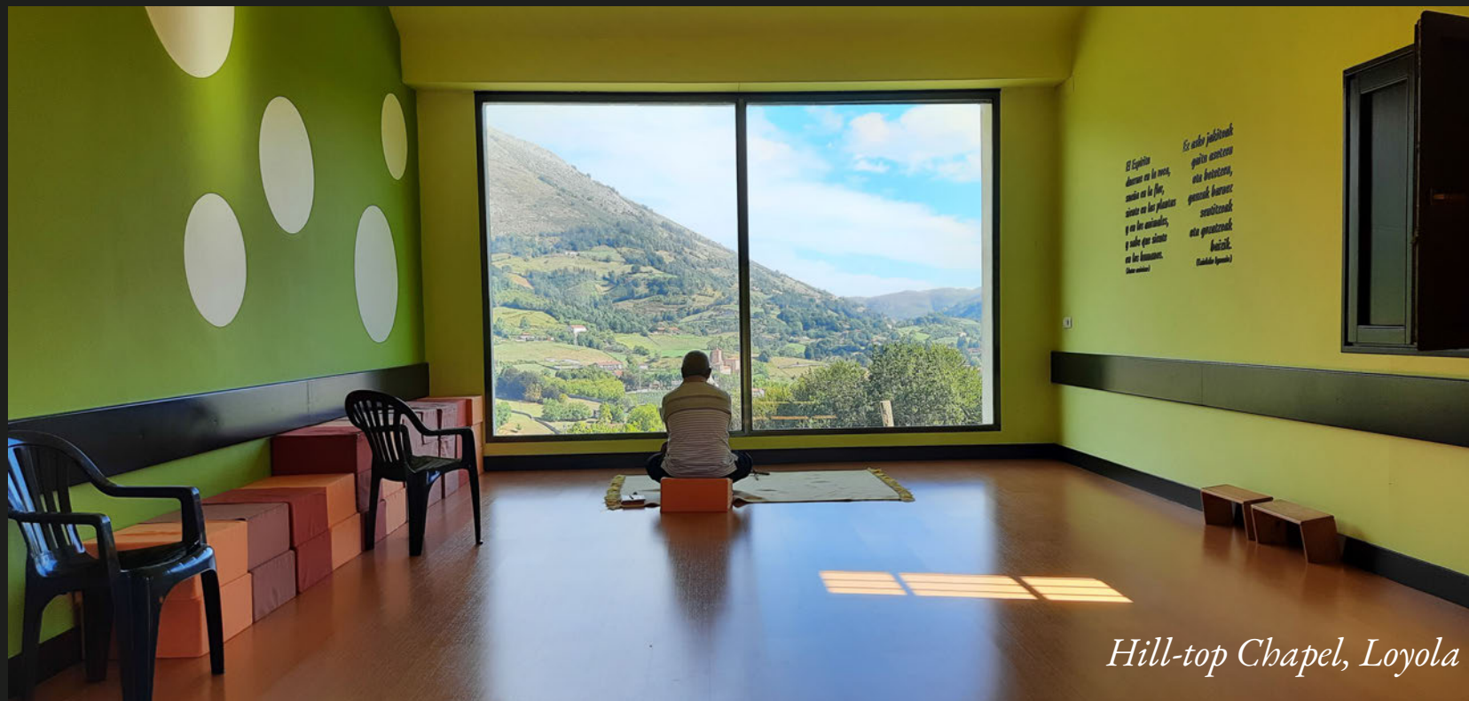
Hill-top Chapel, Loyola