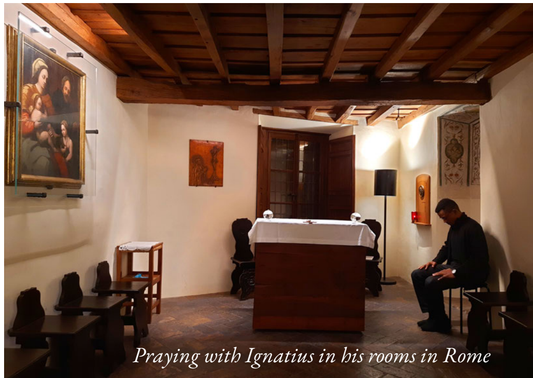
Praying with Ignatius in his rooms in Rome