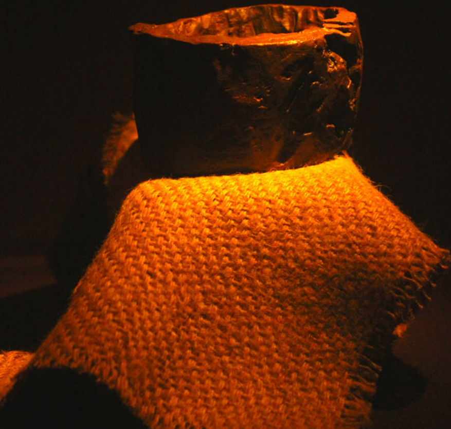
Begging bowl of Ignatius preserved at Manresa